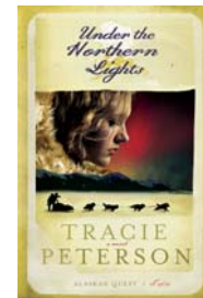
2- Under the Northern Lights 0-7642-2774-2